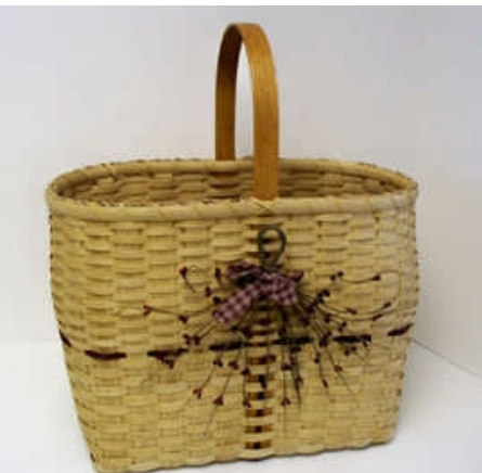
Name Basket Dimensions Complete Kit