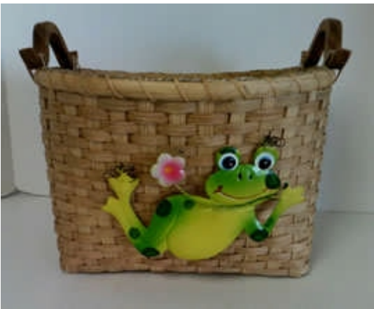
Name Basket Dimensions Complete Kit