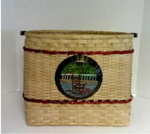
Name Basket Dimensions Complete Kit