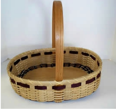
Name Basket Dimensions Complete Kit

Bailey's Bushel 43 circ x 12 x 13 $65.00