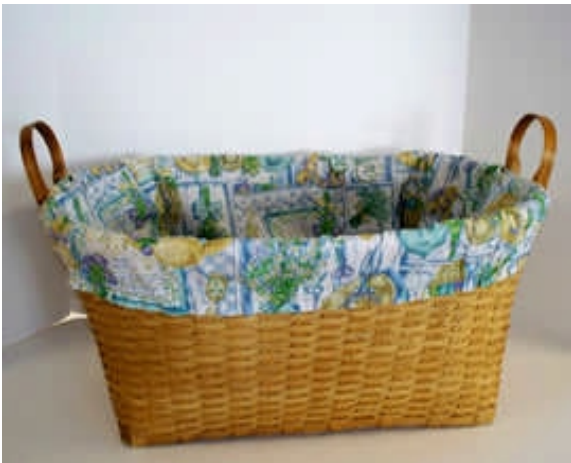
Name Basket Dimensions Complete Kit

Victorian Laundry Basket 18 x 21 x 9 $70.00