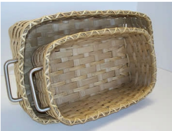
Name Basket Dimensions Complete Kit

Liberty Meadows lg. 7 x 12 x 4 sm. 5 x 10 x 4 $35.00