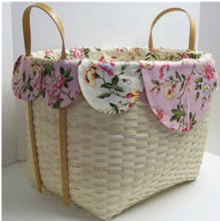
Name Basket Dimensions Complete Kit