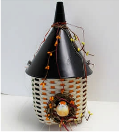
Name Basket Dimensions Complete Kit