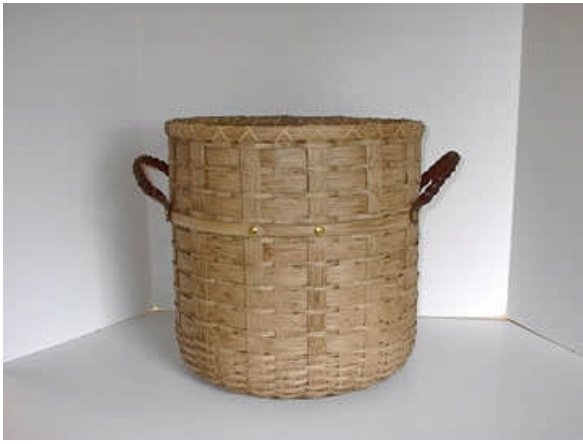
Name Basket Dimensions Complete Kit

Bailey's Bushel 43 circ x 12 x 13 $65.00