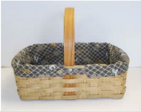
Name Basket Dimensions Complete Kit

Nester, Medim 12 x 12 x 5, w/o handle $38.00