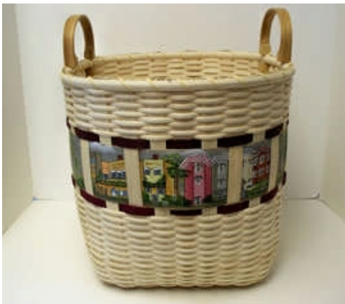
Name Basket Dimensions Complete Kit