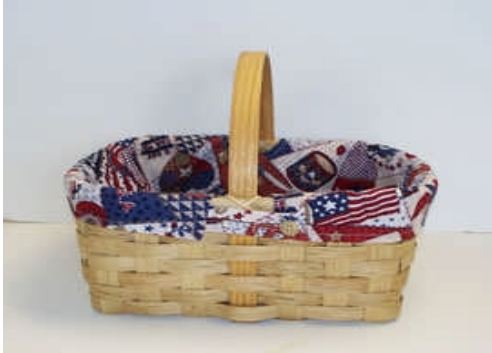
Name Basket Dimensions Complete Kit

Nester, Medim 12 x 12 x 5, w/o handle $38.00