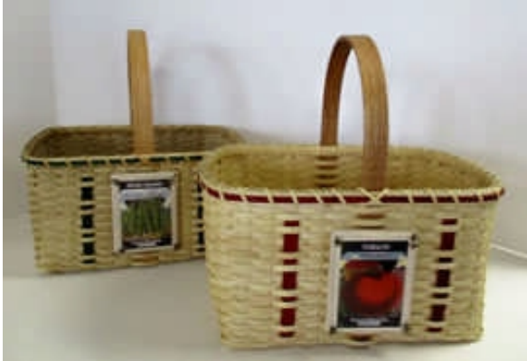
Name Basket Dimensions Complete Kit