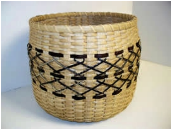
Name Basket Dimensions Complete Kit