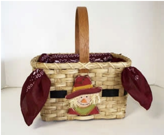
Name Basket Dimensions Complete Kit