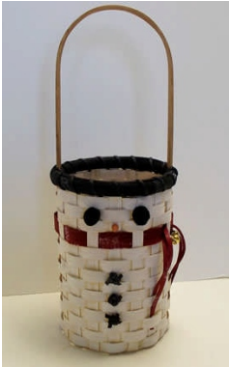
Name Basket Dimensions Complete Kit

Nester, Small 10 x 10 x 5, w/o handle $32.00