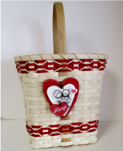
Name Basket Dimensions Complete Kit