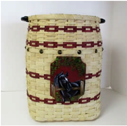
Name Basket Dimensions Complete Kit