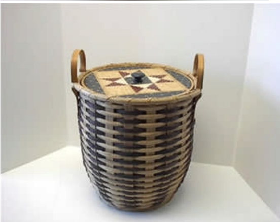
Name Basket Dimensions Complete Kit