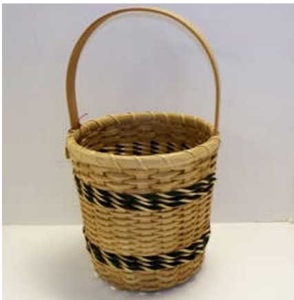
Name Basket Dimensions Complete Kit